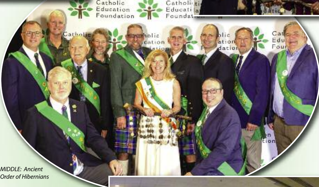
MIDDLE: Ancient Order of Hibernians