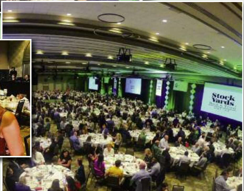
ABOVE: A packed house enjoys the best Salute luncheon ever!