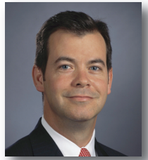
Joseph L. Landenwich Chair