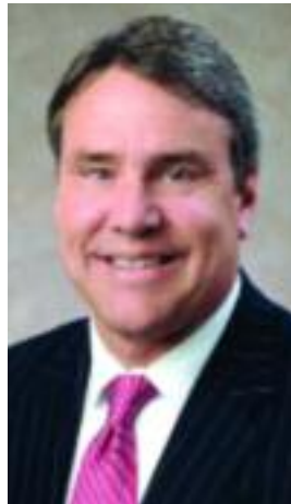
President of the Foundation.