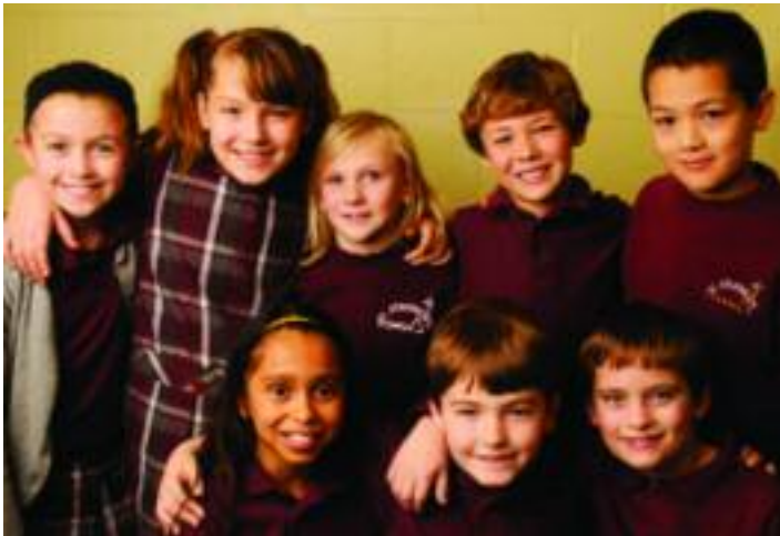
St. Athanasius students